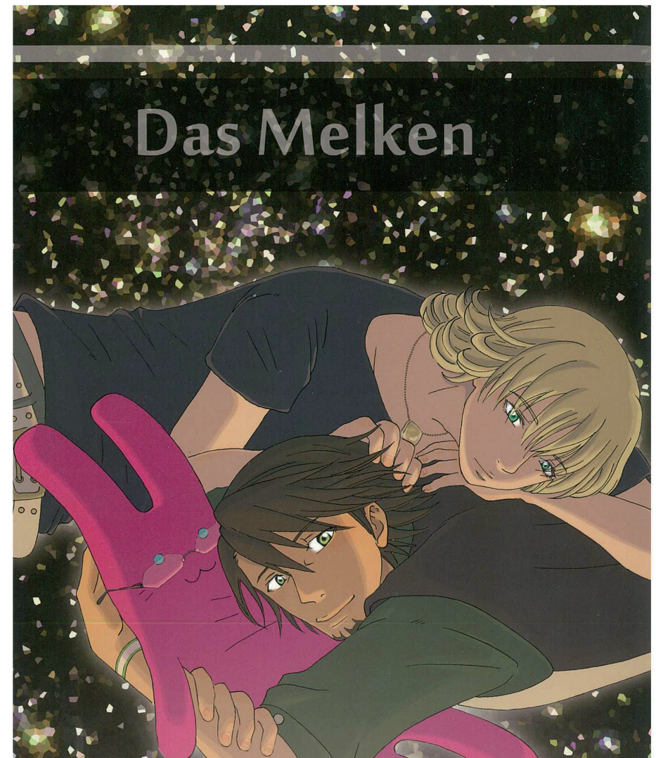
Cover of the BL Fanzine Das Melken (The Milking) made by Yuzukabosu/Halkichi. Tiger "the old man" is not used to having gay sex. Bunny needs to remind the old man that he had made a bet and promised to give him fellatio. Tiger gets upset and tries to get out of the deal but Bunny persists and even demands to see Tiger's face while he is giving fellatio. Tiger is flustered and also inhibited about swallowing semen, while Bunny thinks his shyness is cute. Then Tiger interrupts the session and says that he cannot make sounds during sex and orgasm, and he is embarrassed. 3

In the People's Republic of China the influx of Japanese manga happened in the 1990s and has been more tightly controlled by the government and publishers who are instructed to reduce the Japanese influence and produce censored "Chinese-style" comics and animation. Mainland Chinese fans have