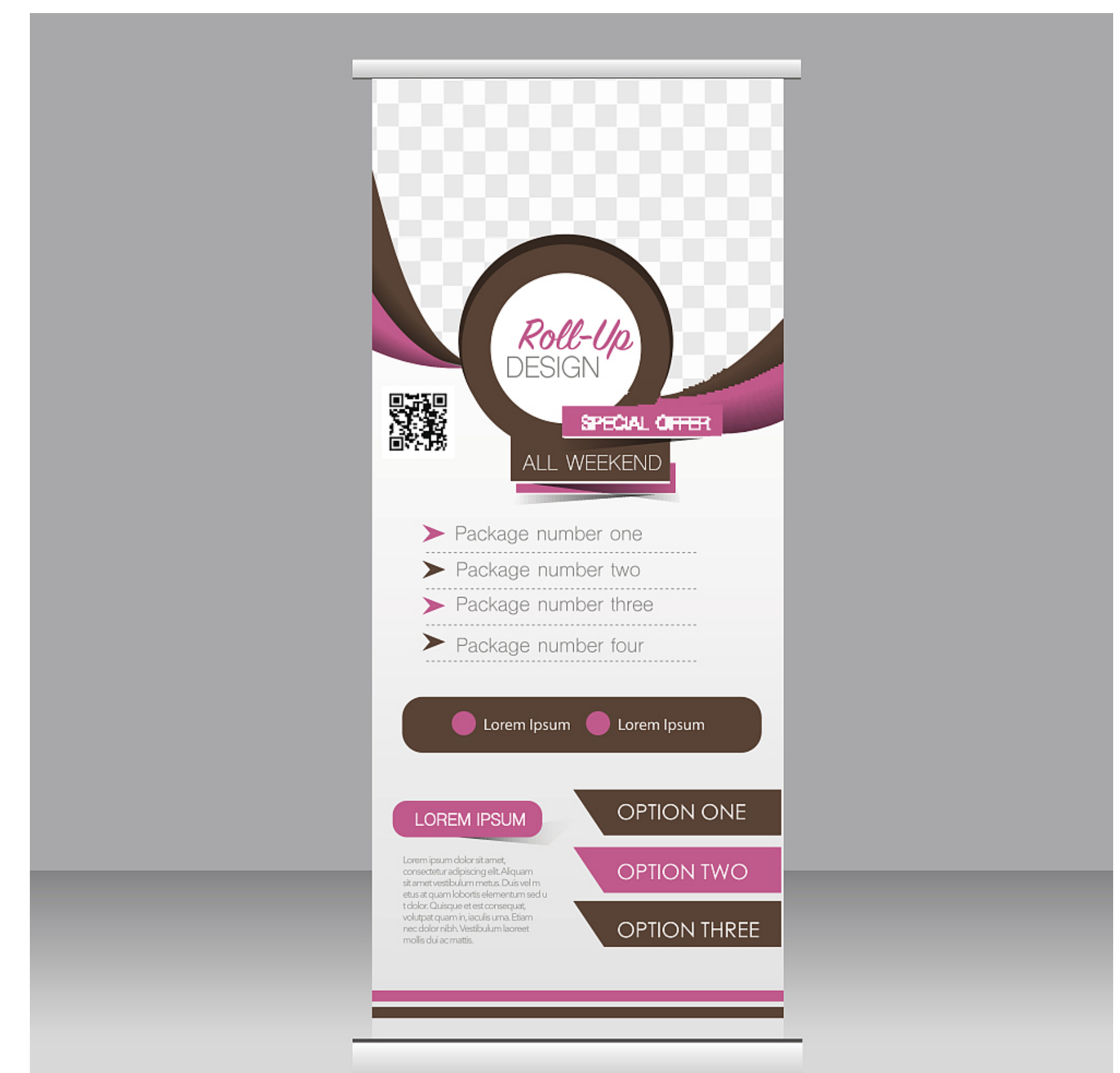
schematic of roll-up