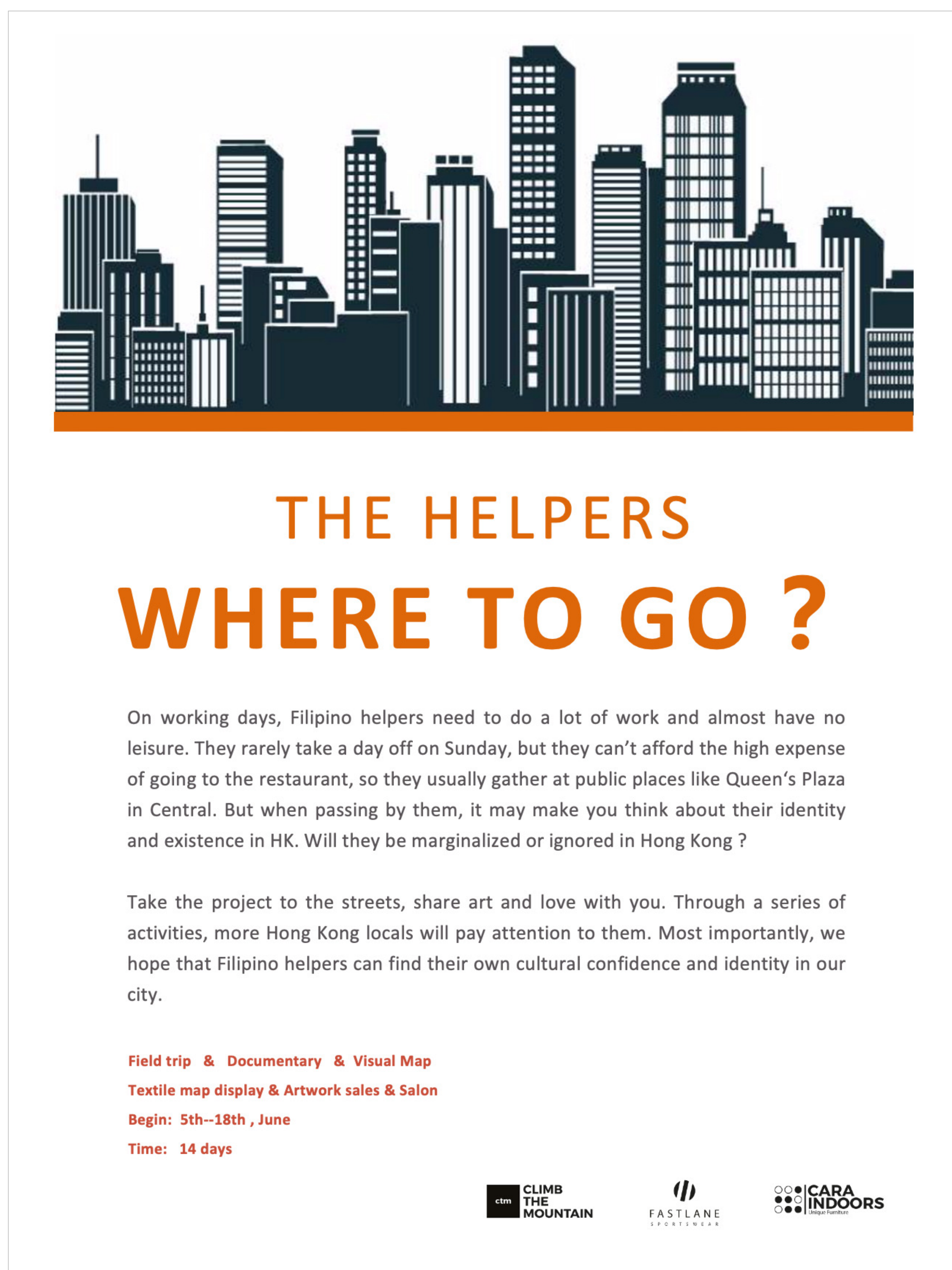
cover of leaflet