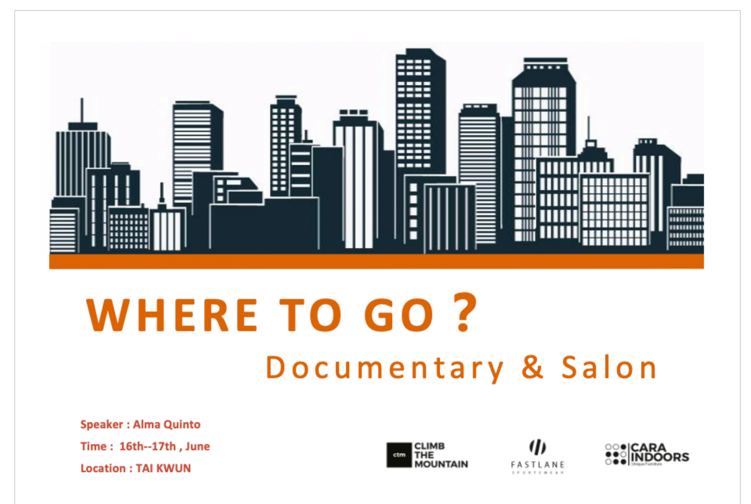
schematic of banner