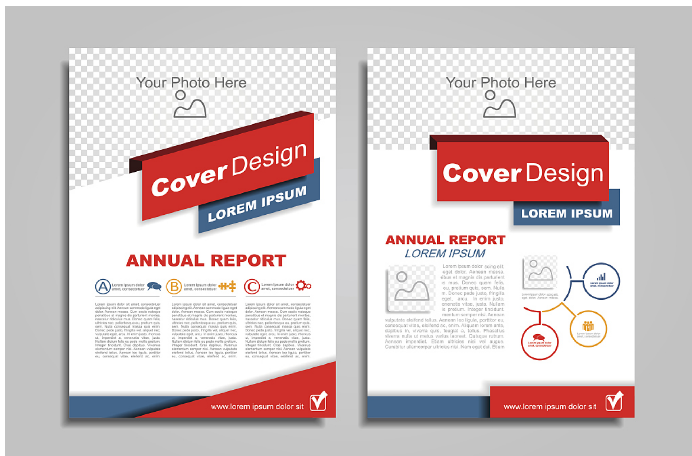
schematic of leaflet

We plan to design some leaflets, posters and roll-up banners in advance and print activities, timeline, content and contact information of relevant staff on it. We can distribute these leaflets in Queens Square, Mong Kok Pedestrian Bridge where Filipino helpers like to gather to attract some potential participants.